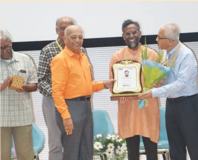
16 th Foundation Day – 21 st March 2024