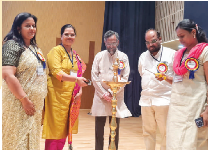
Sahara National Conference