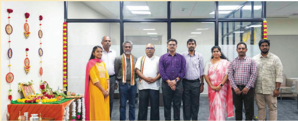
Inauguration Day – 25 th April 2024